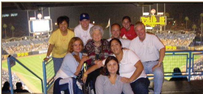
"TAKE ME OUT TO THE BALLGAME, TAKE ME OUT TO THE CROWD..." Mission Care staff and family enjoyed a baseball game at Dodger Stadium on Sept. 26 and were treated to a rare Dodger victory. One resident that is a loyal Dodger fan had not been to a game in 30 years. All enjoyed the atmosphere, game, peanuts and crackerjacks