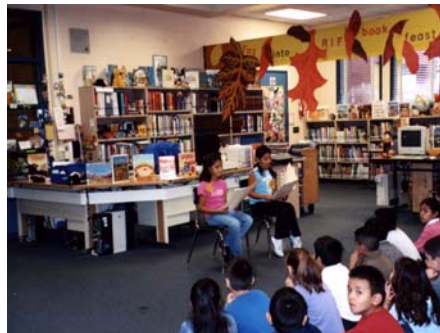
5 th grade students read to lower grades at Montara's Literacy Based Event