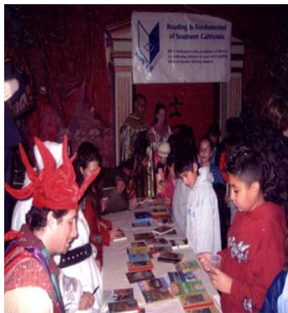
Children choose a RIFSoCal book at Strasberg Theatre